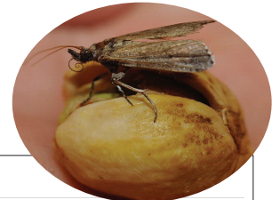
Gargoil® Controls Navel Orange Worm Adults

Infested leaves or shoots were sprayed to runoff with a hand sprayer. After 24 hours, sprayed samples were examined and evaluated microscopically for mortality.