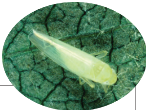
Gargoil® Controls White Apple Leafhopper (WALH) Nymphs

Gargoil can be used on all crops, including fruits and vegetables, fruit trees, vines, tree nuts, field and row crops, ornamental trees, shrubs and flowers, containerized plants, and turf.